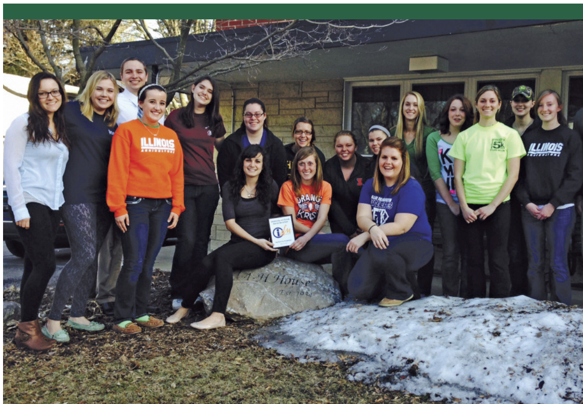
Here are the girls who participated in the Illini Dance Marathon with 4-H House's award for Highest Fundraising Sorority.

each year and celebrates the end of this fundraiser by dancing for 13 hours straight. We had 25 girls raise money for the event and attend the 13 hour marathon as well as donations from the girls in the house. This year the organization had a goal of $100,000. Not only did everyone who participated in the marathon go above and beyond what was expected of them by raising a total of $124,000, but 4-H House was recognized for being the top fundraising sorority on campus! This accomplishment is huge for 4-H House considering that we are one of the smallest sororities on campus. 4-H House had a great philanthropy year and we look forward to the 2014-2015 school year.