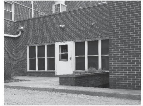
1960 East Patio

As we look to the window of the future, we will need to stay proactive to remain competitive with other places to live on campus. In today's campus world, study areas need to be bright and updated. It has been well worth it to see the House full and more women enjoying the sisterhood that shaped our lives.