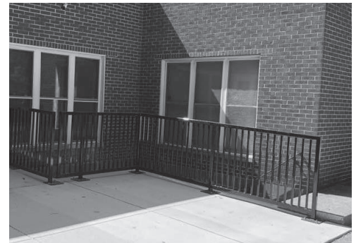
2018 East Patio