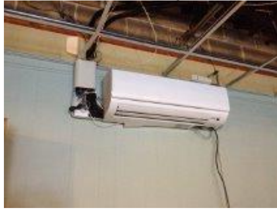
Air Conditioning Unit