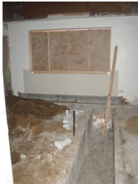
End of Week 1