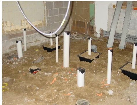
End of Week 3