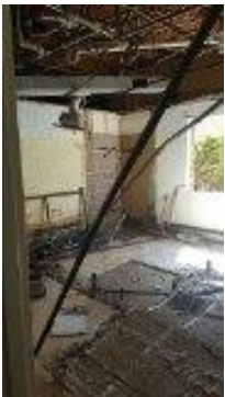
End of Day 1